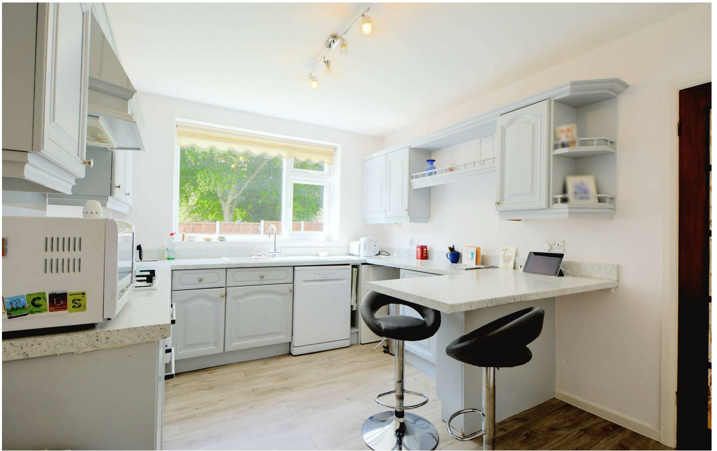
A Substantial Four Bedroom Detached House on a Generous Corner Plot.

Offering a spacious and versatile interior with well presented accommodation throughout, this excellent house displays further development potential subject to the necessary consents and is likely to appeal to a wide variety of potential purchasers but considered ideal for a family looking for larger accommodation.